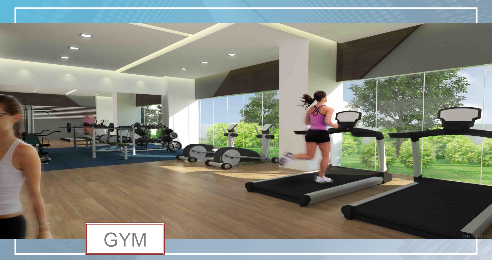
The specifications, descriptions, plans and visuals shown here are intended to give a general idea of the project and are subject to change without prior notice.