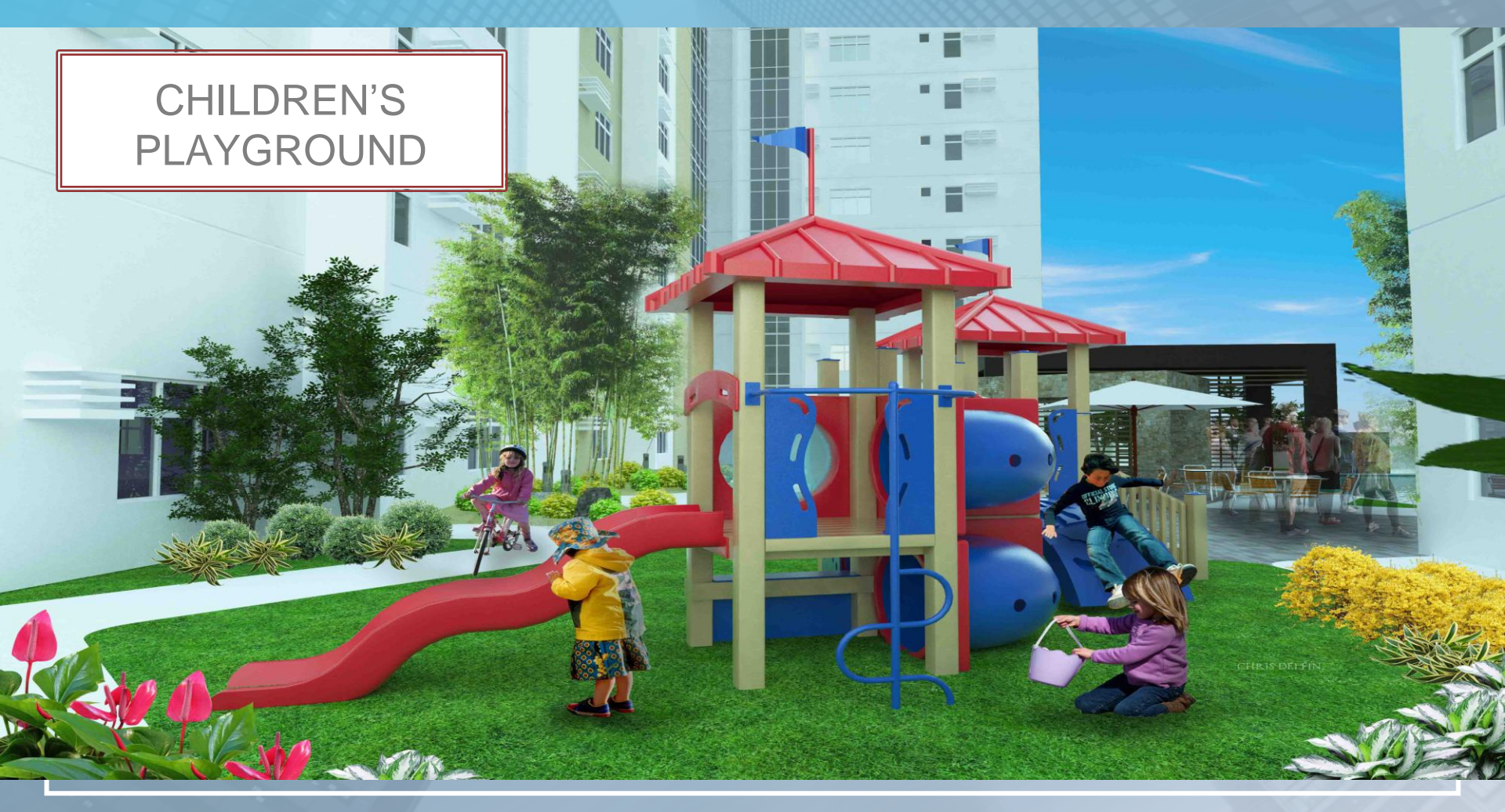
The specifications, descriptions, plans and visuals shown here are intended to give a general idea of the project and are subject to change without prior notice.